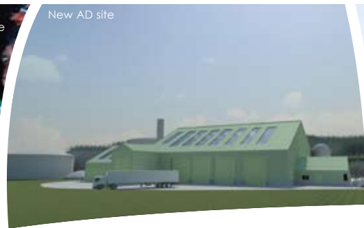
New AD site