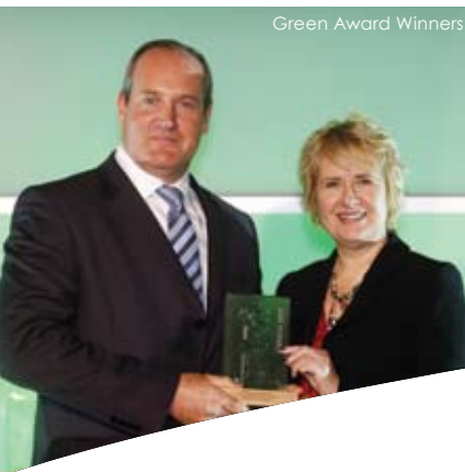
Green Award Winners