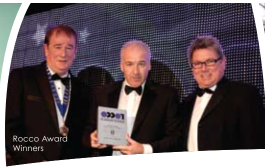
Rocco Award Winners