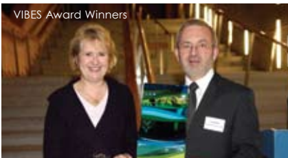
VIBES Award Winners

VIBES Awards 2009: Linwood Site, Best Product/Service Award