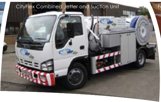
CityFlex Combined Jetter and Suction Unit