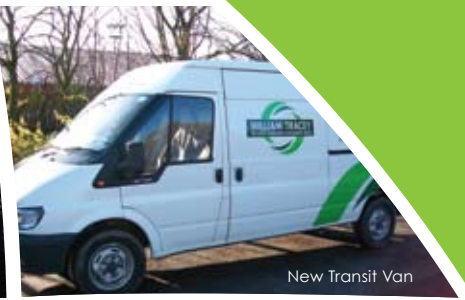
New Transit Van